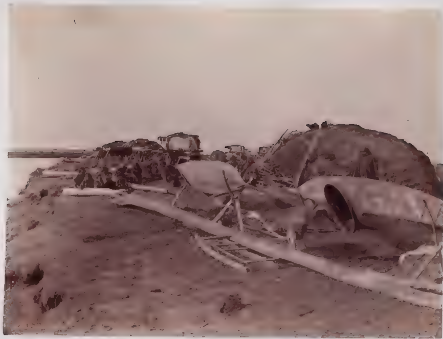
18. Esquimau Village, Kiyack, dog sled.